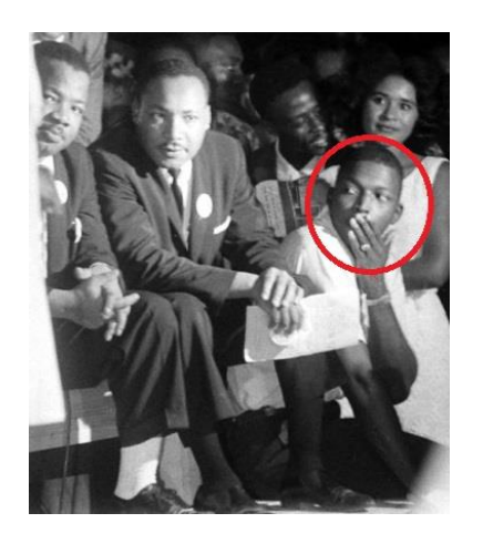
"Birmingham, Alabama the Civil Rights Capital of the World"

"Miles College has as its brand civic engagement and activism. As a matter of fact, during the planning stages of the Southern Christian Leadership Conference (SCLC), when members were deciding what test city to implement the Civil Rights Movement, it was proposed to go to Birmingham, Alabama because the students at Miles College were already engaging in civic protests and boycotts against segregated public facilities. In essence, the Civil Rights Movement, in-part came to Birmingham Alabama, because of the activism of students at Miles College, helping to make Birmingham, Alabama the Civil Rights Capital of the world." (www.miles.edu/about)