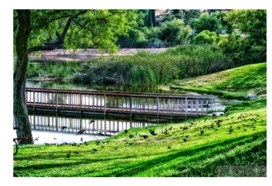
Picture 2 shows the beauty of nature and how all of its amazing components work together to make a perspective to enjoy looking at.

Poem written by Dhaha Nur. It is a composition of her thoughts regarding life from her point of view.