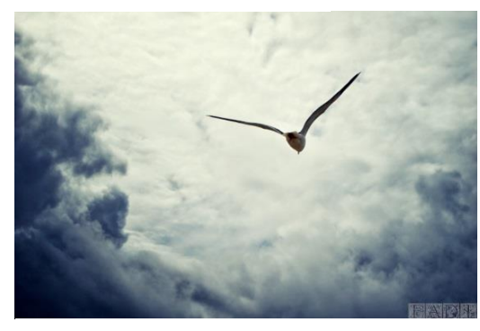
Picture 1 shows freedom and life without limits. It shows the beauty of the sky and how the bird is not afraid of flying to the unknown.